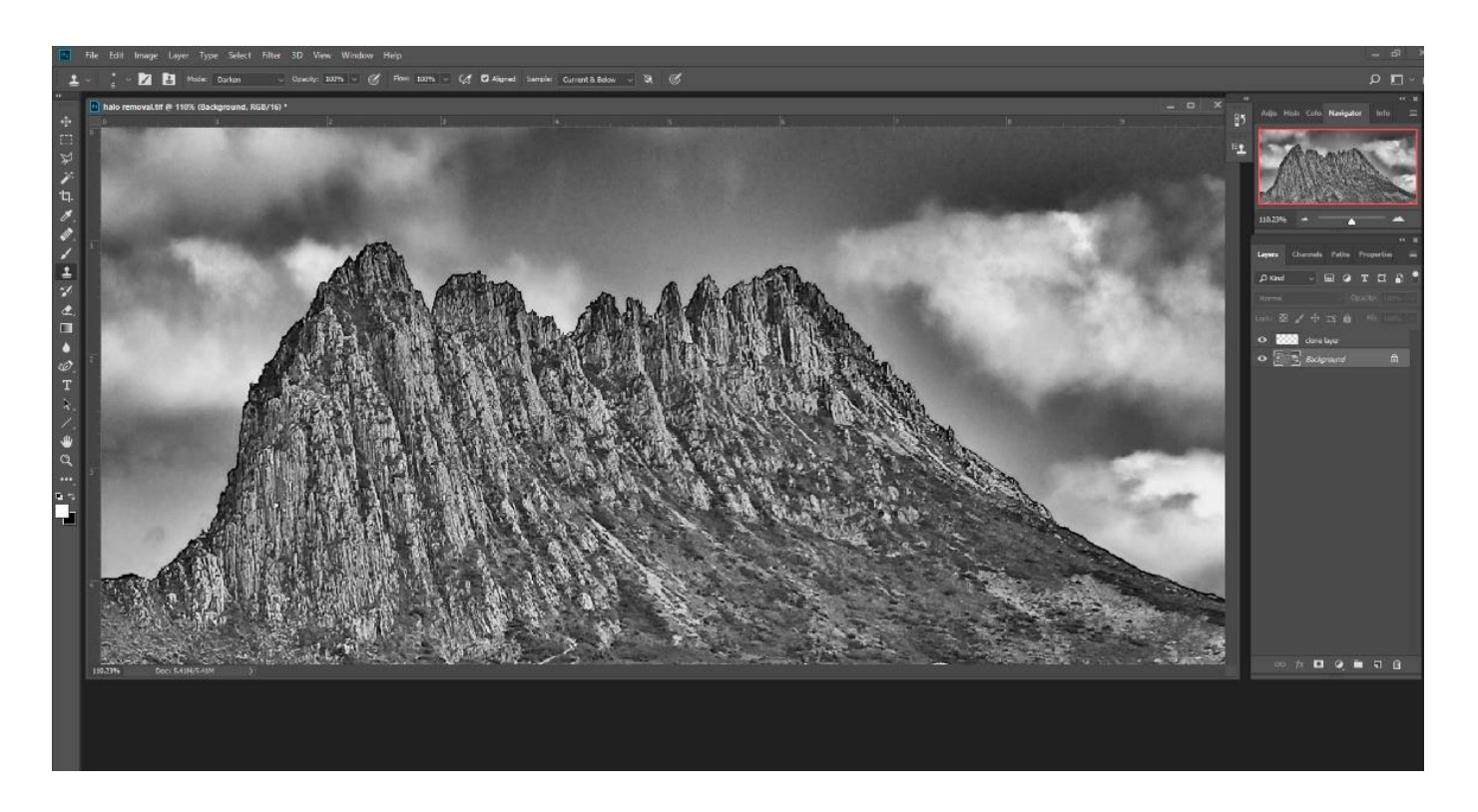
Fig 2: Halo removed

Choose the clone sample from the lighter-toned region of the two regions either side of the halo. In the current example this would be the sky. As the halo is essentially white a nearby small-sized clone sample of the sky when applied to the halo will replace the halo with sky tone leaving the surrounding pixels of sky and mountain essentially unaltered. The removal of the halo can be undertaken quite quickly as you move the clone tool along the halo. Fig. 2 shows the halo removed.